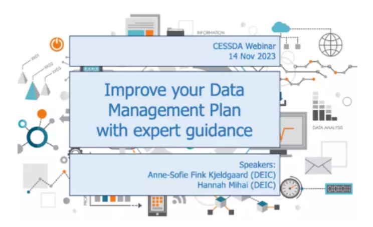
Tue 14 Nov 2023 10:00 CET

Join CESSDA experts for this webinar focusing on the research data life cycle, the FAIR principles and hear about researcher's own experiences with writing a DMP.